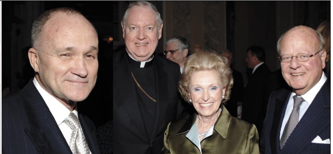
NYPD police commissioner Raymond W. Kelly