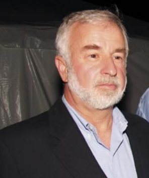
Above: Congressman Tim Bishop